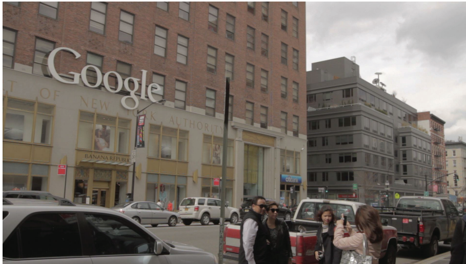
Stills from All that is solid melts into data , 2015.

When I started getting interested in environmental issues in my teaching and research, my assumption had been that businesses and government would treat social and environmental externalities in broadly similar ways. But the more I thought about it the more it seemed that the dynamic associated with each of them was different.